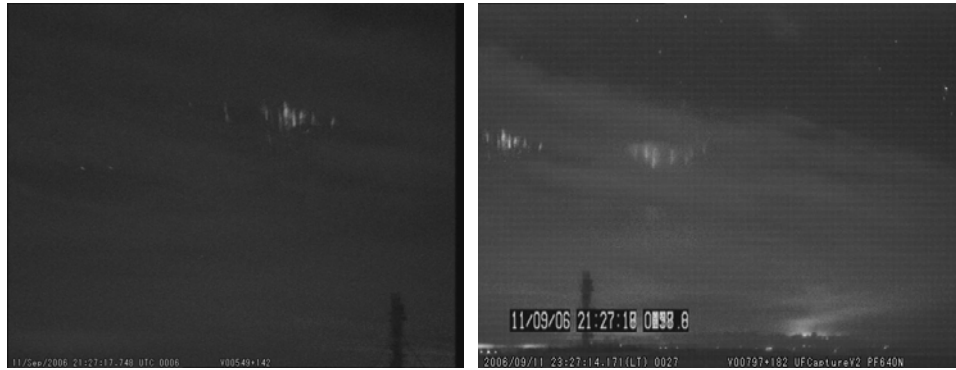
Figure-1: Sprite events captured by both cameras at the same time. Left image was taken Toulouse Watec902H camera and the right image was taken with TAU's Watec100N camera. Putting both cameras close-by but pointed at different directions, with a small overlap, allowed us to capture both of the sprites.